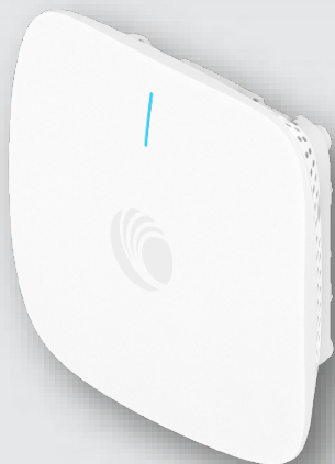
Front Panel with Mounting Bracket