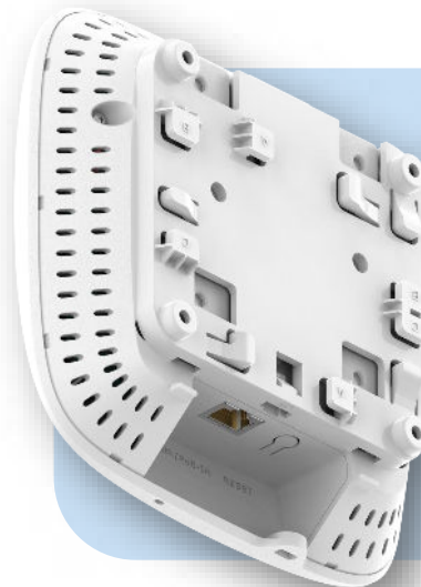
XV2-21X back panel with mounting bracket

The XV2-21X offers multiple installation methods included in the same shipping box. Mount the AP to a ceiling tile using the included steel plate; mount to an existing junction box with 83 mm center-to-center holes; twist lock the AP onto a 36 mm, 24 mm, and 14 mm T-bar; or simply mount it to any flat surface using the included wall anchors. No additional accessory brackets are needed.