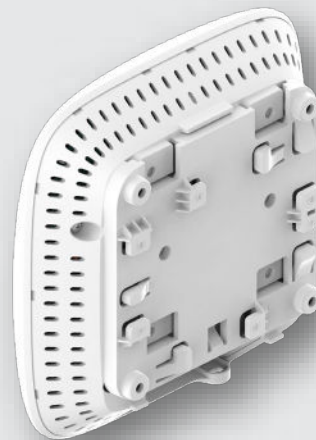
Back Panel with Mounting Bracket